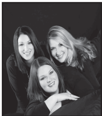
3 LANES CROSSING